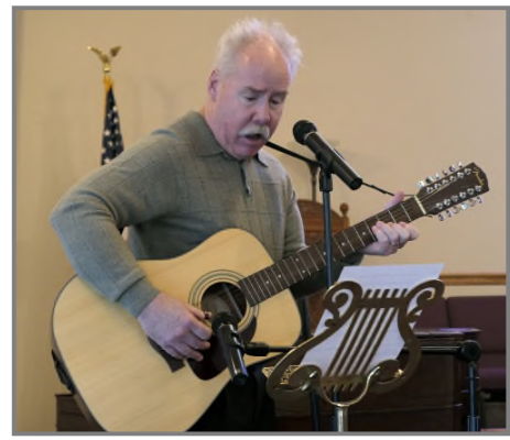
March Social 3/31/19